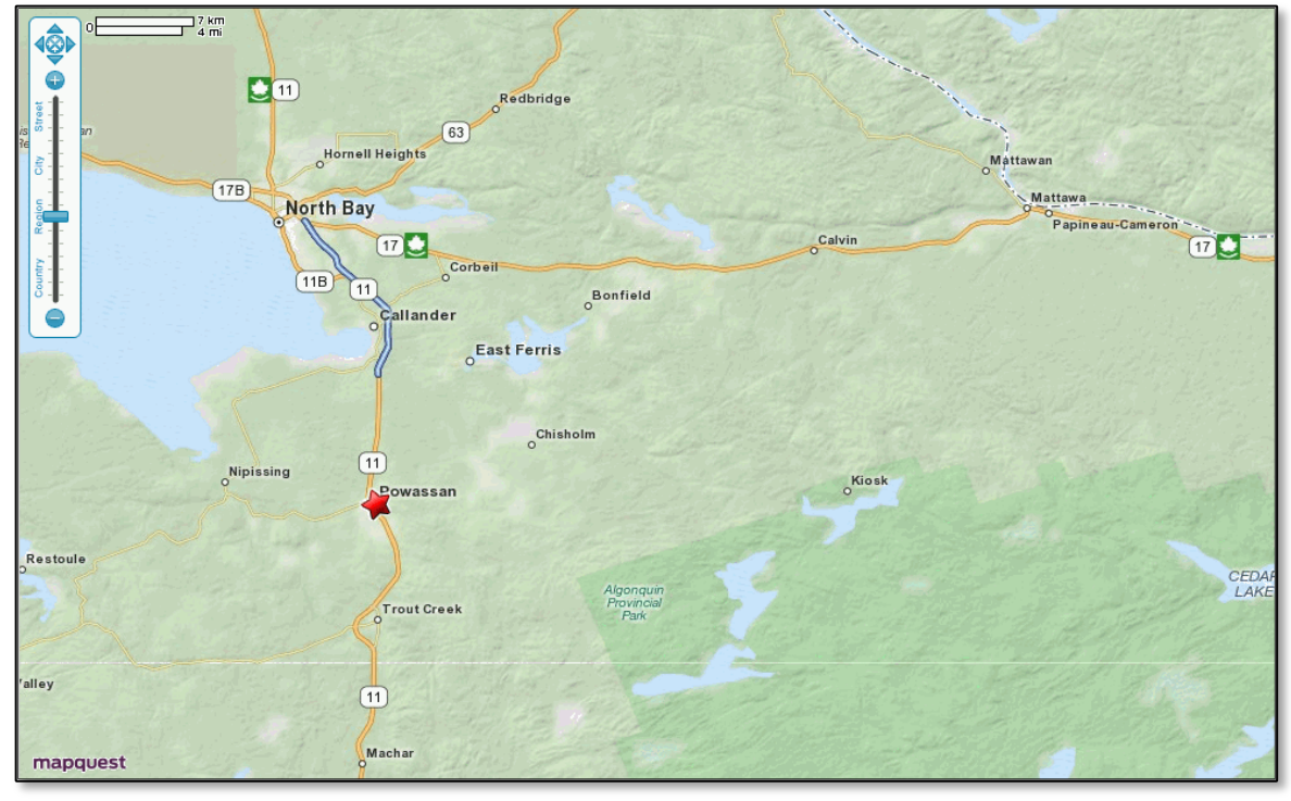
Figure 1: Powassan Location Map

Powassan is located near North Bay, Ontario, Canada in the Parry Sound District, at its easternmost boundary with the Nipissing District.